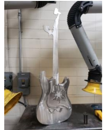
The sculpture in process