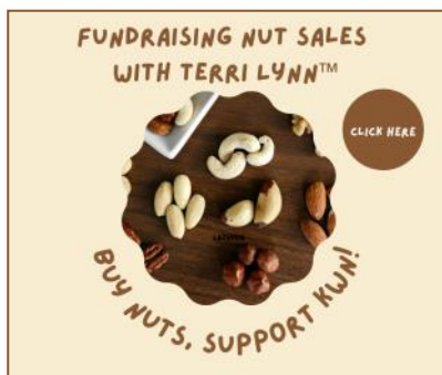
Remember, your mother would love some nuts!

Did you know that there are two ways you can support KWN's mission, just by shopping? One is by buying nuts through our fundraising link with Terri Lynn®. The other is by choosing Amazon Smile when you shop on Amazon. Go to https://smile.amazon.com/ and choose Kenosha Women's Network as your default charity to support. Any time you shop on Amazon (and let's face it, who doesn't shop on Amazon?), remember to select Amazon Smile. Between the nuts and Amazon, you pretty much have Mom covered for Mother's Day!